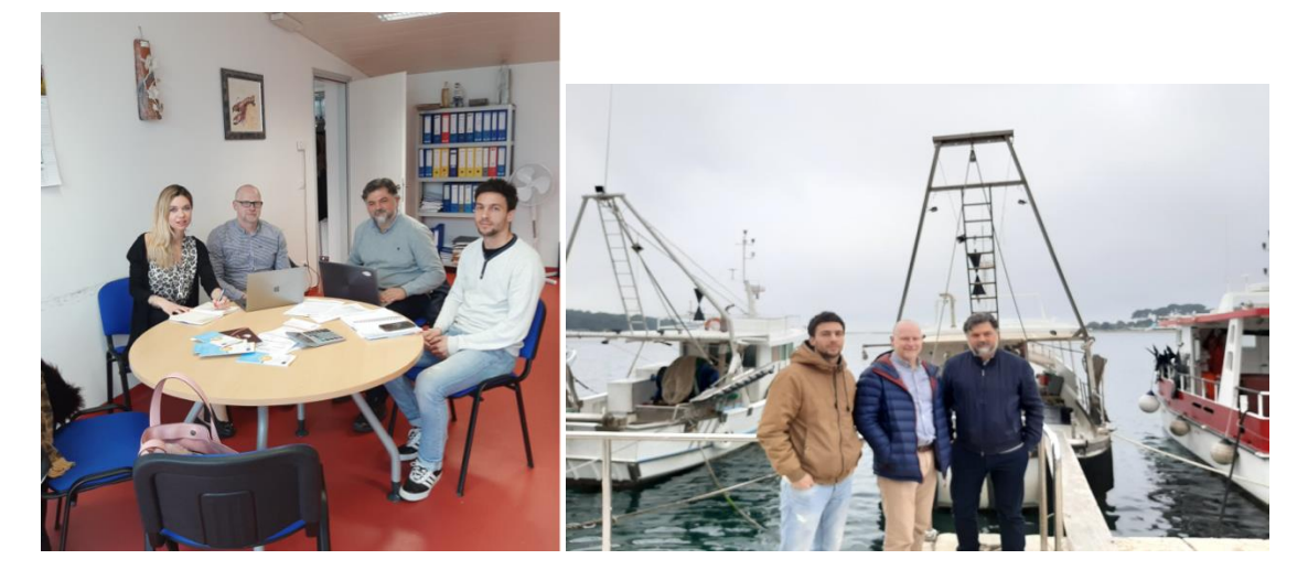
Fig. 6.1. - Meeting at ISTRA premises and visit at the Porec fishing port

In Benkovac, it was possible to visit OMEGA 3 premises and to have a look at the processing operations.